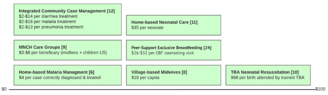
Figure 2. Cost per beneficiary for a range of community-based RMNCH interventions [6, 8–12, 24]

most contextually specific estimate of total costs and the most appropriate for planning purposes. Resources and examples of this type of costing approach can be found at the end of this brief.