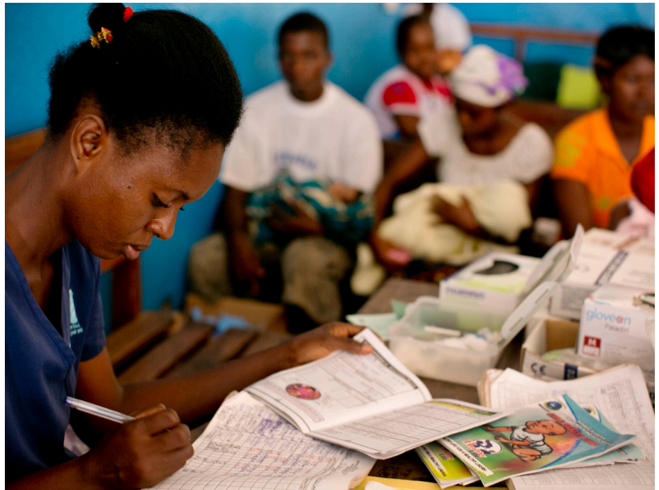
Photo: A nurse fills in vaccination booklets in the outpatients department of a government hospital in Buchanan, Liberia

Learning activities are designed to be “action oriented” and follow the strategy of focusing on “short loop” and practical learning aimed at improving implementation practices to drive high coverage, quality and equity for high-impact interventions. MCSP also works intensively to study and support implementation processes for scale-up of more than 30 high-priority, high-impact interventions and introduction of promising innovations.