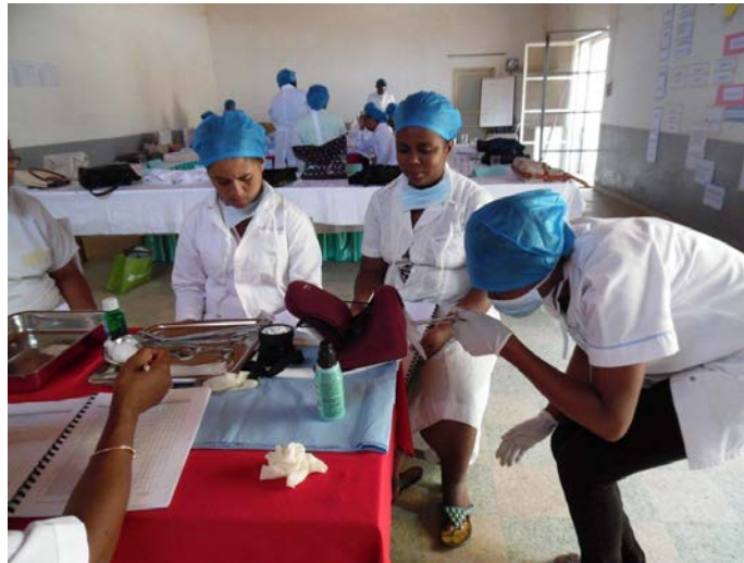
Providers in training practicing the insertion of an intrauterine device on an anatomical model.

MCSP's objective of strengthening the capacity of 1,175 providers in PPFp counseling and services by the end of the project has utilized an innovative "blended training" approach that combines onsite and long-distance learning with supportive supervision via site visits and mobile mentoring. A competency-based approach is used during the training, with trainees performing exercises on anatomic models before practicing on clients. After each training, a start-up kit, including technical equipment for intrauterine device insertion and removal, and technical equipment for implant removal, was provided to each health center to enable trained health workers to immediately apply their newly gained skills. To improve demand generation, MCSP collaborated with bilateral projects working within target districts to integrate PPFp messages into existing communication materials.