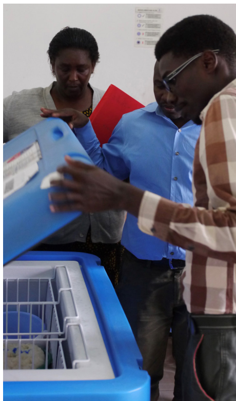
The district immunization vaccine officer at a health facility in Morogoro district, Tanzania.