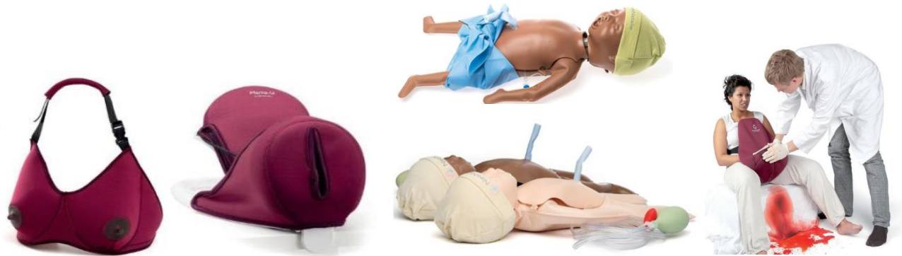
Figure 1: Type and Number of Laerdal Global Health Anatomical Models Procured by MCSP for the MTC

MamaBreast (14): A wearable simulator that allows highly realistic simulation of breastfeeding and breastmilk expression.