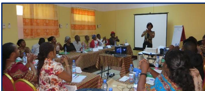
Handwashing techniques are demonstrated during the February 2018 CCA training at the MTC.

WASH is an essential component of quality MNH care. In February 2018, MCSP and the MOH trained 34 providers at the MTC on WASH standards and practices in healthcare facilities, and specifically the Clean Clinic Approach. The training covered the basics of water supply (access, required quantity, and quality) in healthcare facilities; hygiene measures for infection prevention and control, including hand hygiene, cleaning and disinfection of premises and medical equipment; and medical waste management, including segregation, transportation, storage, treatment, and safe final disposal. The training also covered management and leadership for WASH, the importance of routine audits, personnel management, mechanisms for gathering and incorporating client feedback, and empowering cleaners as key partners in promoting WASH and QA at the facility level.