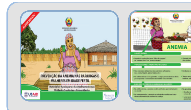
Figure 1: Mozambique MOH and MCSP developed suite of anemia counseling materials