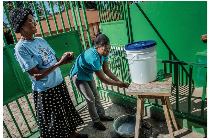
At a clinic in Marmalade, which has adopted the Clean Clinic standards, a team of people take shifts cleaning the clinic.

The USAID Maternal and Child Survival Program (MCSP)'s Services de Santé de Qualité pour Haiti (SSQH) project is working in close conjunction with the Ministry of Health ( Ministère de la Santé Publique et de la Population or MSPP) and all 10 of the country's health departments ( Direction Départementale de la Santé or DDS) with the overarching goal of facilitating a sustainable health system. SSQH provides technical, financial, and material support to the DDSs and 164 MSPP- and non-governmental organization (NGO)-supported sites to strengthen health provider capacity, increase utilization of health services, improve the quality of health services and referral networks, develop managerial capacity, and support the formulation and implementation of national and departmental health policies.